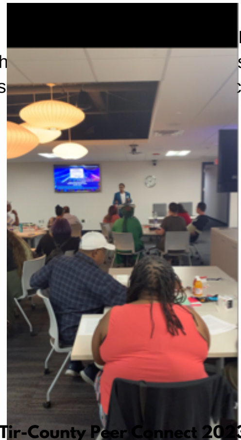
Tir-County Peer Connect 2023