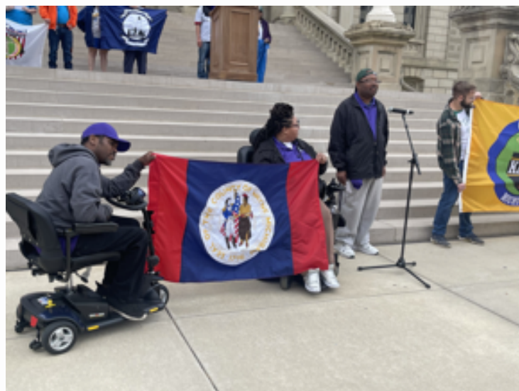
DWIHN Staff and Representatives