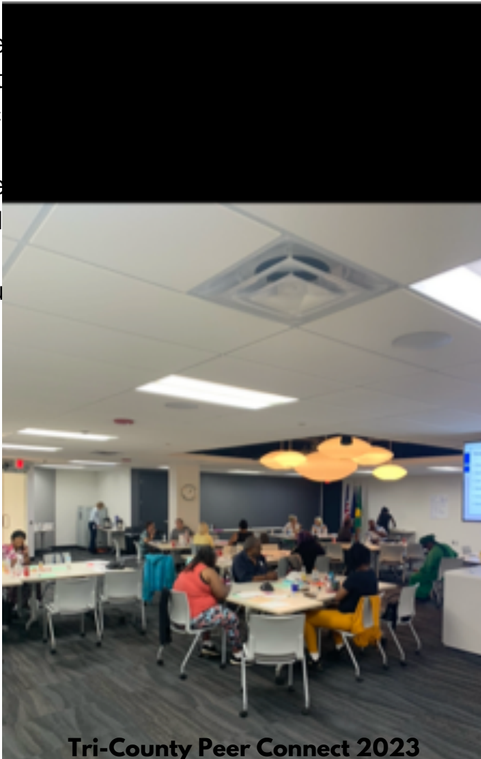
Tri-County Peer Connect 2023

The tool used 5.5 edu ed pertinent members. Th may be us Peers s with chigan